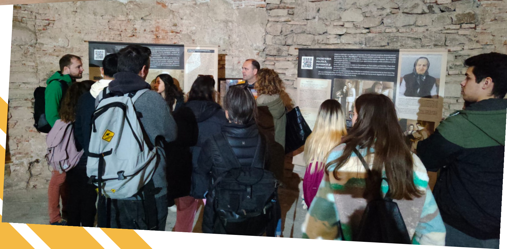
Round table and meeting with the author of Women in Resistance in Romania in Făgăraș Fortress